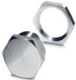
M16 screw plug for unused M12 housing cutouts

Please be informed that the data shown in this PDF Document is generated from our Online Catalog. Please find the complete data in the user's documentation. Our General Terms of Use for Downloads are valid ( http://phoenixcontact.com/download )