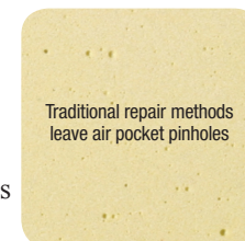
Traditional repair methods leave air pocket pinholes

3M's enhanced cartridge design delivers the perfect ratio of mixed product to the car's surface. With traditional mixes, up to 40% of the product can end up unused. However, with 3M's Dynamic Mixing System, you don't lose what you don't use – significantly reducing waste . The absence of air in the cartridge and mixing nozzle prevents over-catalyzation and virtually eliminates pinholes. Within this sealed environment, the filler or glaze and hardener are mixed to a perfect ratio – for outstanding results in less time.