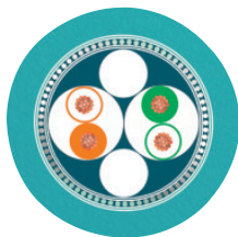
PUR ETHERNET 2x2 FLEX [93E]