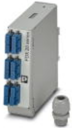
DIN rail splice box, fully mounted ready to splice, for 6x SC duplex (OS2)

Please be informed that the data shown in this PDF Document is generated from our Online Catalog. Please find the complete data in the user's documentation. Our General Terms of Use for Downloads are valid ( http://phoenixcontact.com/download )