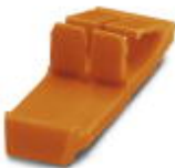
Latching, Number of positions: 2, Color: orange