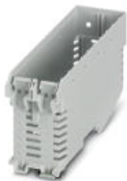
Component housing, length: 120.6 mm, Lower part, color: light gray, width: 37.6 mm, height: 57.7 mm

Please be informed that the data shown in this PDF Document is generated from our Online Catalog. Please find the complete data in the user's documentation. Our General Terms of Use for Downloads are valid ( http://phoenixcontact.com/download )