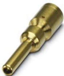
Crimp contact, turned, Single contact, contact diameter: 3.6 mm, crimp range: 16 mm 2 ... 16 mm 2

Please be informed that the data shown in this PDF Document is generated from our Online Catalog. Please find the complete data in the user's documentation. Our General Terms of Use for Downloads are valid ( http://phoenixcontact.com/download )