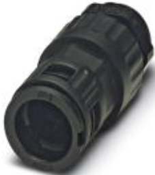
Cable gland, metric thread, IP66 protection, with strain relief

Please be informed that the data shown in this PDF Document is generated from our Online Catalog. Please find the complete data in the user's documentation. Our General Terms of Use for Downloads are valid ( http://phoenixcontact.com/download )