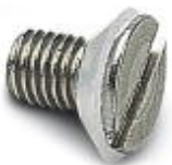
Sealing screw, for IP65 protection

Sealing screw - HC-D 7-DS-IP65 - 1686229