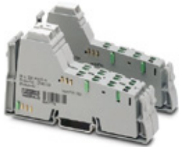
Inline power terminal block, without accessories, without fuse, 230 V AC

Please be informed that the data shown in this PDF Document is generated from our Online Catalog. Please find the complete data in the user's documentation. Our General Terms of Use for Downloads are valid ( http://phoenixcontact.com/download )