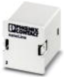
Replacement cover for slot 2 in base unit.

Covering hood - NLC-MOD-CAP-PXC - 2701292