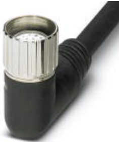
Socket M23, angled, 19-pos., with 15.5 m master cable

Please be informed that the data shown in this PDF Document is generated from our Online Catalog. Please find the complete data in the user's documentation. Our General Terms of Use for Downloads are valid ( http://download.phoenixcontact.com )