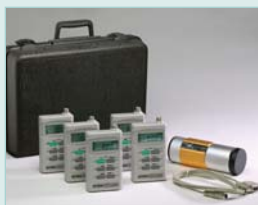
407355-KIT-5 Dosimeter Kit

Includes PC Windows® compatible software to maintain records and statistically analyze acquired data