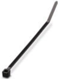
Cable tie, resistant to UV rays, dimensions: L x W, 200 x 2.5 mm, color: black

Please be informed that the data shown in this PDF Document is generated from our Online Catalog. Please find the complete data in the user's documentation. Our General Terms of Use for Downloads are valid ( http://download.phoenixcontact.com )