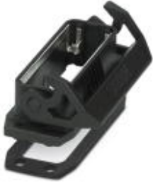
HEAVYCON EVO panel mounting base, plastic, D25, with single locking latch and flat gasket

Please be informed that the data shown in this PDF Document is generated from our Online Catalog. Please find the complete data in the user's documentation. Our General Terms of Use for Downloads are valid ( http://phoenixcontact.com/download )