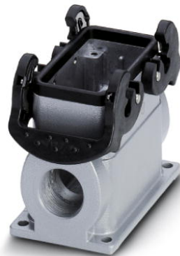
Figure shows a product variant with a height of 74 mm

http://eshop.phoenixcontact.de/phoenix/treeViewClick.do?UID=1604754