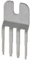
Plug bracket, for SKN 5 diodes, pitch: 5.2 mm, length: 4 mm, width: 19 mm, height: 35.2 mm

Please be informed that the data shown in this PDF Document is generated from our Online Catalog. Please find the complete data in the user's documentation. Our General Terms of Use for Downloads are valid ( http://phoenixcontact.com/download )