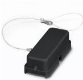
HEAVYCON protective cover, D25, for HC-EVO-D25... supporting base element, for single locking latch, with retaining cord with combination eyelet, IP54, PA

Please be informed that the data shown in this PDF Document is generated from our Online Catalog. Please find the complete data in the user's documentation. Our General Terms of Use for Downloads are valid ( http://phoenixcontact.com/download )