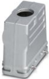
HEAVYCON sleeve housing B16, for double locking latch, height 76 mm, with thread M25, straight cable outlet, EMC version

Please be informed that the data shown in this PDF Document is generated from our Online Catalog. Please find the complete data in the user's documentation. Our General Terms of Use for Downloads are valid ( http://download.phoenixcontact.com )