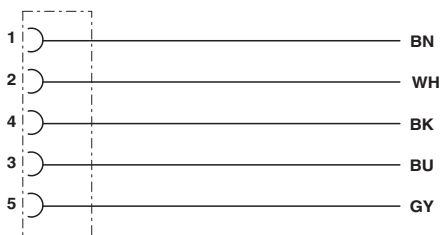
Contact assignment of the M12 socket