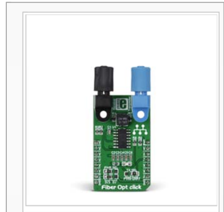
Fiber Opt click