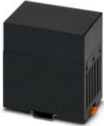
Electronic module, for PCB insertion, with a high 35 mm covering hood

Please be informed that the data shown in this PDF Document is generated from our Online Catalog. Please find the complete data in the user's documentation. Our General Terms of Use for Downloads are valid ( http://phoenixcontact.com/download )