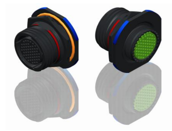
LAYOUT SHOWN AS EXAMPLE