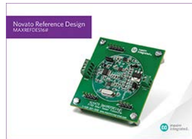
The Novato reference design accurately measures and transmits industrial temperatures. [High-resolution images: ]

San Jose, CA—February 25, 2014—Factories can now easily, and very accurately, measure and transmit industrial temperatures with the Novato ( MAXREFDES16# ) reference design, a 4–20mA loop-powered temperature transmitter with the HART® communication protocol from Maxim Integrated Products, Inc. (NASDAQ: MXIM).