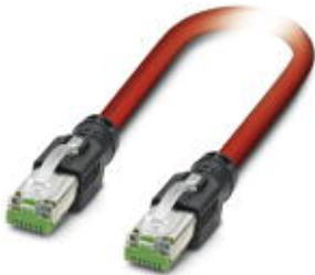
SERCOS III patch cable, shielded, star quad, AWG 22 stranded (7-wire), RAL 3020 (traffic red), RJ45 connector/IP 20, straight, to RJ45 connector/IP20, straight, length: 1.0 m

Please be informed that the data shown in this PDF Document is generated from our Online Catalog. Please find the complete data in the user's documentation. Our General Terms of Use for Downloads are valid ( http://download.phoenixcontact.com )