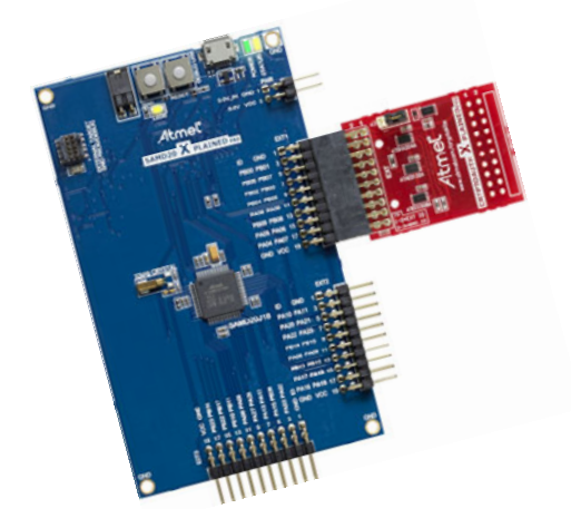
Figure 3. AT88CK101 Development Kit