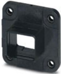
Panel mounting frames, Degree of protection: IP65/67, Material: Plastic

Please be informed that the data shown in this PDF Document is generated from our Online Catalog. Please find the complete data in the user's documentation. Our General Terms of Use for Downloads are valid ( http://phoenixcontact.com/download )