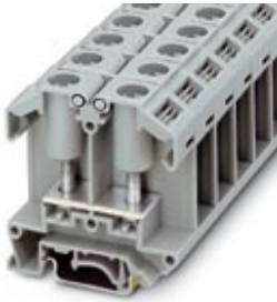
Universal terminal block with bolt connection, cross section: 1 - 25 mm 2 , width: 18 mm, color: gray

Please be informed that the data shown in this PDF Document is generated from our Online Catalog. Please find the complete data in the user's documentation. Our General Terms of Use for Downloads are valid ( http://download.phoenixcontact.com )