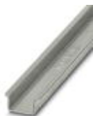
DIN rail, material: Steel, unperforated, 2.3 mm thick, height 15 mm, width 35 mm, length: 2 m

DIN rail - NS 35/15-2,3 UNPERF 2000MM - 1201798