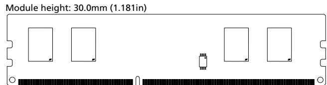
Figure 1: 240-Pin UDIMM (MO-269 R/C C)