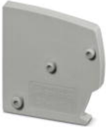
Spacer plate, Color: gray

Please be informed that the data shown in this PDF Document is generated from our Online Catalog. Please find the complete data in the user's documentation. Our General Terms of Use for Downloads are valid ( http://download.phoenixcontact.com )