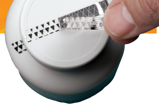
3M™ Tamper-Evident Label FMV01202 leaves a silver telltale pattern when removed.