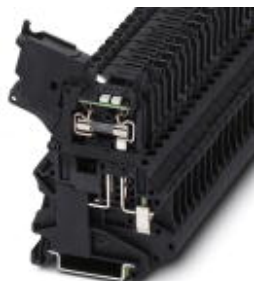
Lever-type fuse terminal block, black, for 5 x 20 mm G fuse inserts, with LED for 24 V DC

Please be informed that the data shown in this PDF Document is generated from our Online Catalog. Please find the complete data in the user's documentation. Our General Terms of Use for Downloads are valid ( http://phoenixcontact.com/download )