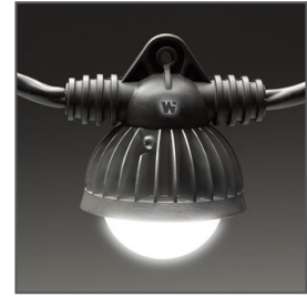
LED String Light

Polycarbonate lens protects light source Outdoor rated and able to withstand the elements