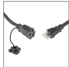
NEMA 5-15 Cord Ends