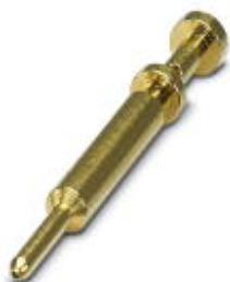
Crimp contact, turned, contact diameter: 1 mm, crimp range: 0.06 mm 2 ... 0.25 mm 2

Please be informed that the data shown in this PDF Document is generated from our Online Catalog. Please find the complete data in the user's documentation. Our General Terms of Use for Downloads are valid ( http://phoenixcontact.com/download )