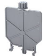
Mounting Accessories for CTSPC