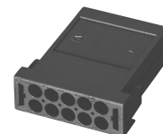
Abbildung stellvertretend für alle verfügbaren Polzahlen.

Subseries Heavy duty connector heavy|mate - C146 M