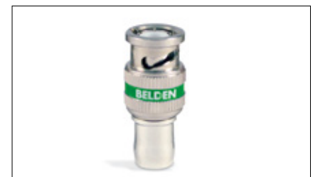
1695ABHD1 RG6 Plenum Size 2 BNC HD Connector