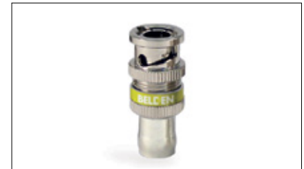
179DTBHD1 179 Digital Truck BNC with Locking Connector

Traditional pin, collar and connector approach, but designed specifically for Belden cable tolerances for better performance and durability. Compatible with select competitive crimp tools and die sets.