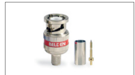
1505ABHD3 RG59 BNC HD Connector