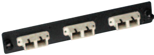
AX100094 Single density, loaded with 3 SC Duplex