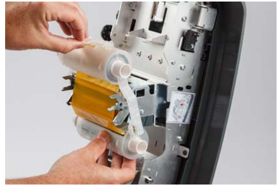
Ribbon installs in 5 seconds...snaps into place!