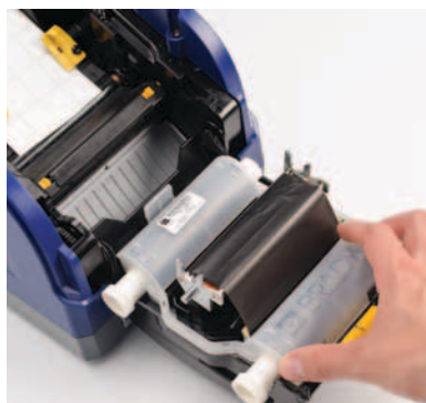
Installs in 3 seconds and the ink always faces the right direction!