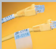
Voice & Data Communications