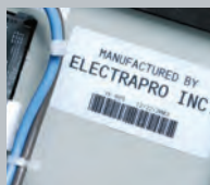
Industrial Barcode Labels