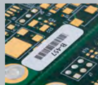
Circuit Board Labels