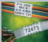
Wire & Cable Labeling