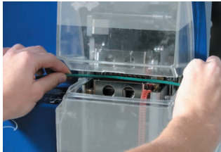
Select job, insert wire or cable.