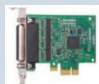
PX-260: LP PCIe 4xRS232 1MBaud