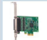
PX-701: PCIe 4xRS232 (4x9 pin cable)