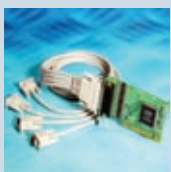
UC-260: LP uPCI 4xRS232