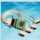
UC-271 LP uPCI 4xRS232 DB25

For Standard Profile see UC-701 & UC-756