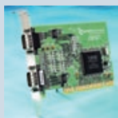
UC-302: uPCI 2xRS232 1MBaud