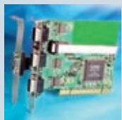
UC-420: uPCI 3+1xRS232