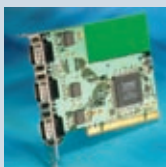
UC-431 uPCI 3xRS232