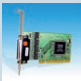
UC-756 uPCI 4xRS232 DB25