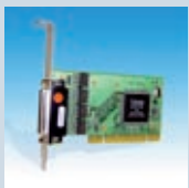
UC-701: uPCI 4xRS232