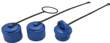
PXP4081 PXP4082 PXP4083