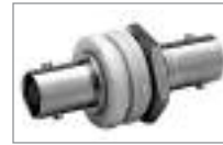
Isolated Dual BNC (F) 1/2" & 5/8" Chassis Mount Hole