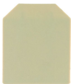
Insulation plate, Colour: Beige